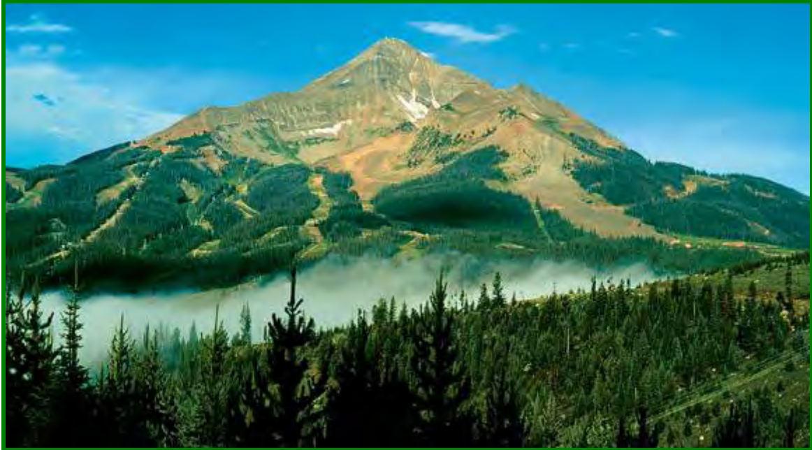
Near All Saints, Big Sky