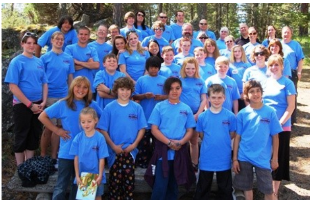
Grace Camp 2010

Our mission is to restore all people to unity with God and each other in Christ.