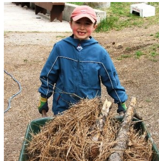
Young volunteers help move slash during Labor of Love

Is there a deadline? NO. These ministries are ongoing.